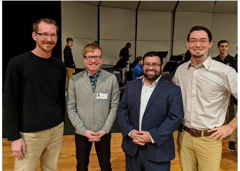
John Mackey, 2nd from left, with Westside's Band Directors

The Wolf Band was honored to host John Mackey, one of the most prestigious band composers of our time, for a Q & A session and educational clinic in the Westside Auditorium last week. Mr. Mackey is a prolific composer of contemporary music, primarily for high school and university wind bands and orchestras. Westside's Wind Ensemble worked on Mackey's piece, "Sheltering Sky", under his guidance. They prepared the composition for their performance at the "John Mackey Festival" at Lamar Consolidated High School later in the week.